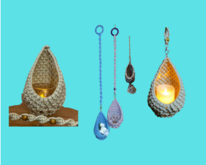
Attach 5th photo of your art or craft: (optional)