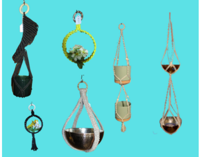
Attach 7th photo of your art or craft: (optional)