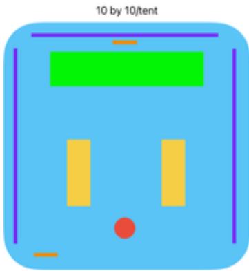
10 by 10/tent

Attach a photo of your display (if you have one):